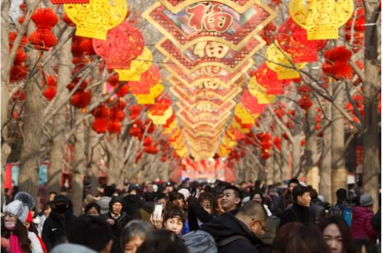
Caption: Ditan Park on the first day of the Lunar New Year of the Pig in Beijing, China, February 5, 2019.