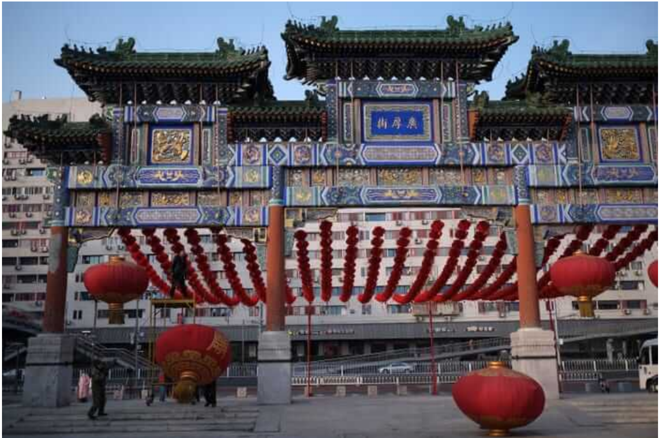
Caption: 2020: Ditan Park after the Lunar New Year celebration was cancelled in 2020.