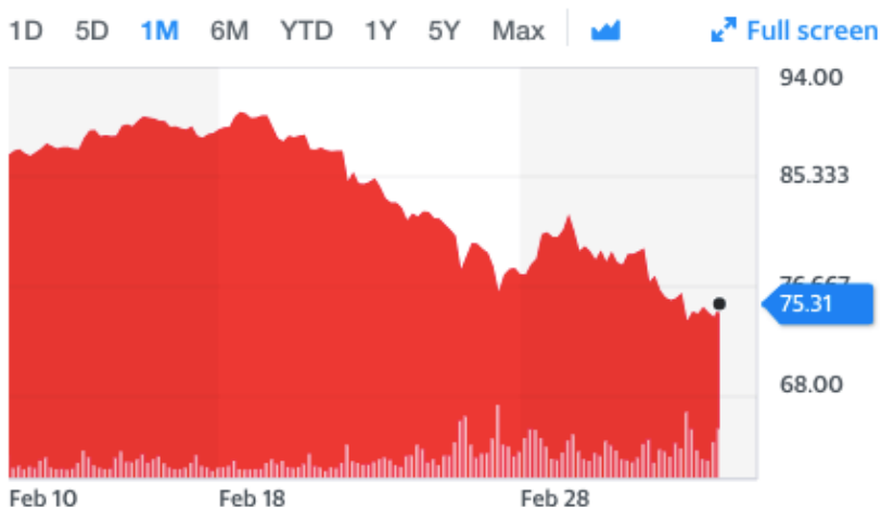
Starbucks Stock Price, Monday March 9, 2020, in $

Manufacturing problems: Let's do this through an example. Apple, Inc, the makers of the iPhone, iPad, MacBooks and other products and services, manufactures a lot of its devices in China. It has warned its investors that because factories in China were shut for so long they will not have enough iPhones to sell to meet the demand for iPhones. So people have calculated that Apple's potential to earn money was higher before the coronavirus hit than it is right now, and what they are willing to pay for each share of Apple, Inc, will also be less today than it was before the news hit. This has happened to a lot of companies across the world as many companies get parts from China and also manufacture in China. Therefore, stock markets across the world are falling in value. So people who have invested in shares of these companies are suffering because their investments are then losing value every day!